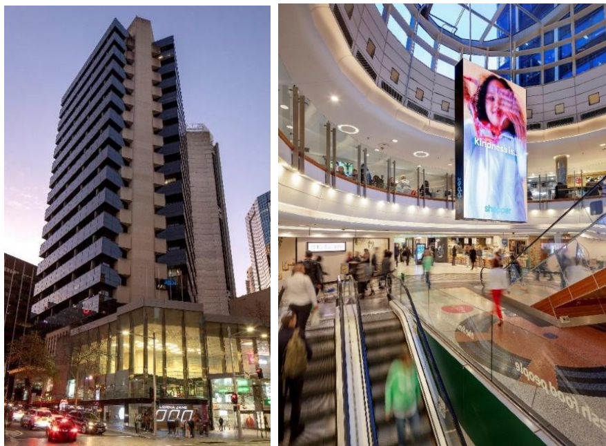
Appearance of 60 Margaret Street (left) and internal view (right)